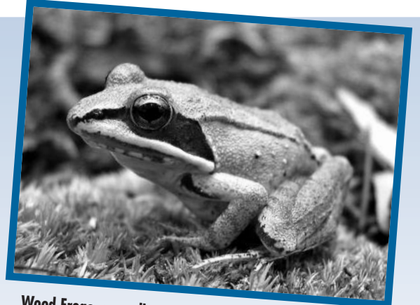
Wood Frogs, as well as other amphibian and reptiles species, are susceptible to a new wildlife disease, Ranavirus .

By the way...New Jersey had a head start going into this survey. Our vernal pool and amphibian breeding records are way ahead of the other four states, thanks to projects like the Vernal Pool Survey, New Jersey Herp Atlas, and Calling Amphibians Monitoring