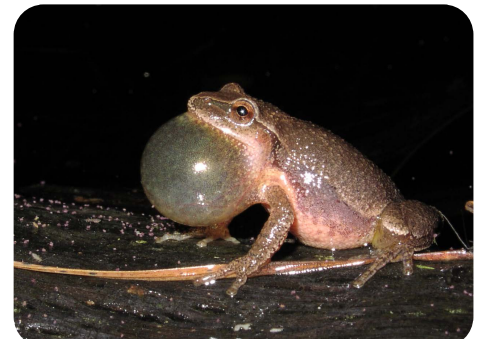
^ Spring Peeper calling.

Clean rubber boots are best footwear, but not critical. Dress warm.