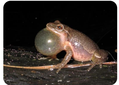
^ Spring Peeper calling.

What to Bring: Your own flashlight! Sun will set around 8:00 pm, so the woods will be dark on our way out. Clean rubber boots are best for footwear, but not critical. Dress warm.