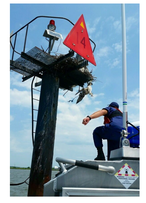
The U.S. Coast Guard assists with the recovery of a dead nestling who was entangled in plastic monofilament, photo by Kathy Clark/ENSP.

marsh areas. These are the same areas where ospreys collect nesting material. Ospreys can be easily entangled in string, ribbon, monofilament, or rope/twine or suffocated by plastic sheeting or bags when in the nest. On the saltmarsh it is often hard to distinguish from synthetic and natural materials (eelgrass looks like white balloon ribbon; sea lettuce looks like white single use plastic bag). Ospreys simply use this material as it's become a more abundant resource. Almost all nests in New Jersey contain some type of plastic. This year a few young ospreys needed to be rescued and untangled, while several more were found dead from being entangled in monofilament or plastic line. We're planning more efforts to document the presence of plastics in nests, and hope to use data and photographs to raise awareness for reducing people's dependence on single use plastics.