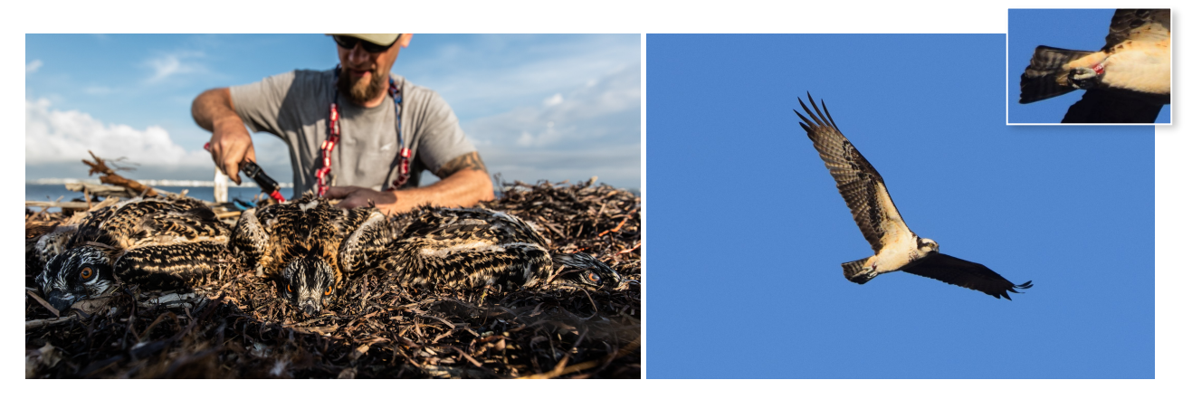
Left: Osprey 04/D being banded as a nestling (on right). Right: 04/D photographed in Allendale, NJ during spring.

This is our fourth year of auxiliary banding young ospreys in nests on Barnegat Bay. A total of 66 young were banded with red auxiliary "field readable" bands with codes from 66/H to 99/H and 00/K to 30/K. Twenty-one young were banded inside Sedge Islands WMA and forty-five in surrounding areas. The total number banded since 2014 is 327. A few