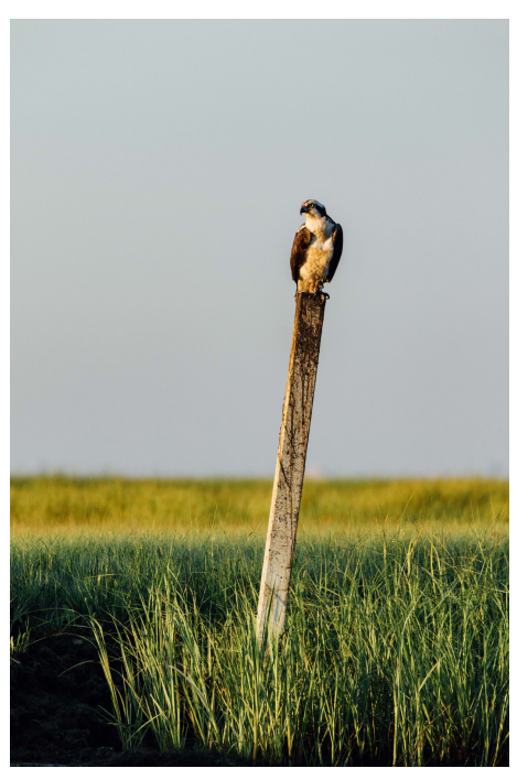
A male osprey stands guard on a perch next to his nest

Ospreys continue to thrive in New Jersey. Nest surveys conducted by volunteers during the peak of the nestling period (late June-early July) resulted in documenting the outcome of 87% of 589 surveyed nests. We credit the successful work by our dedicated volunteers and faithful "Osprey Watchers" to report on nests all along the coast and major rivers. The goal of this project is to monitor and manage the state population of breeding ospreys to ensure they remain stable in New Jersey. We hope that the work conducted as a part of this project will help protect the species while closely monitoring for any indication of emerging threats.