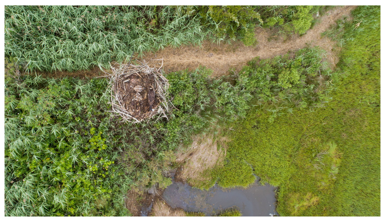
A drones view of an osprey nest in Barnegat Light, NJ

surveyed, the most ever in a "non-census" survey year, where the outcome was determined in 87% (512). For a non-census year, these are very positive results with broad representation of the statewide population. Surveys confirm that the majority of the population nests along the Atlantic Coast (505), with a robust population on the Delaware Bay and its tributaries (78) and few up north in the Meadowlands and inland areas (6 - there are more nests but many went undocumented). Data analyzed from this year's survey indicates that overall, ospreys had a very productive year. The average statewide productivity rate was 1.82 young per known-outcome nest, which is very close to what was found last year (1.72) and in 2016 (1.78). Productivity averaged higher in Delaware Bay nests, as we observed in previous years, at 2.24 vs. 1.75 for the Atlantic. This is likely due to the efforts by Citizens United to Protect the Maurice River to maintain the nest osprey platforms to very high standards.