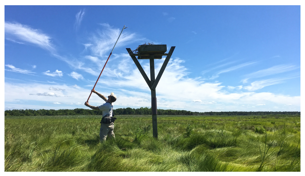
A nest is surveyed using a mirror on an extension pole

(~95%) are built on man-made nest platforms. They are accessed using an extension ladder, viewed from a distance with optics, or viewed using a mirror on an extension pole. During the nest survey, we document the presence of adults, number of eggs or young and their age, and the type of nest structure. While there, we also check the condition of the nest structure and remove any unnatural nest material, especially plastic marine debris which is can entangle or suffocate an osprey.