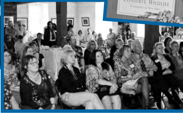
CWF supporters and friends enjoy the awards presentations