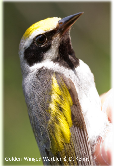
Golden-Winged Warbler

Contact: Kelly Triece Phone: 908-852-2576 ext. 122 Email: Kelly.Triece@nj.usda.gov