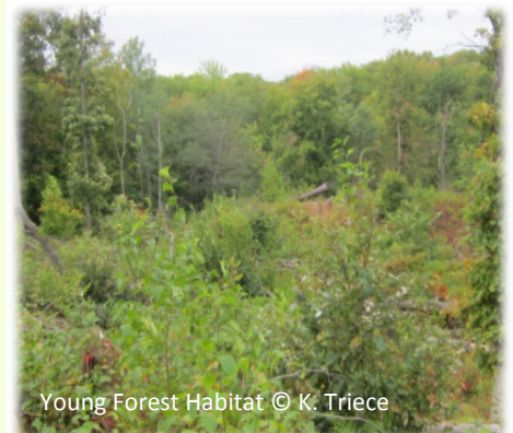
Young Forest Habitat

USDA is an equal opportunity provider and employer.